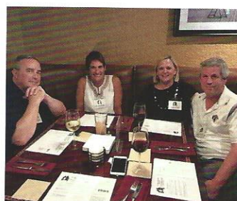
Table 1 dinner